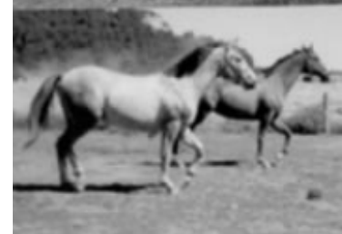
Rosey 16 months with Irish Millenium 15.3hh in background.