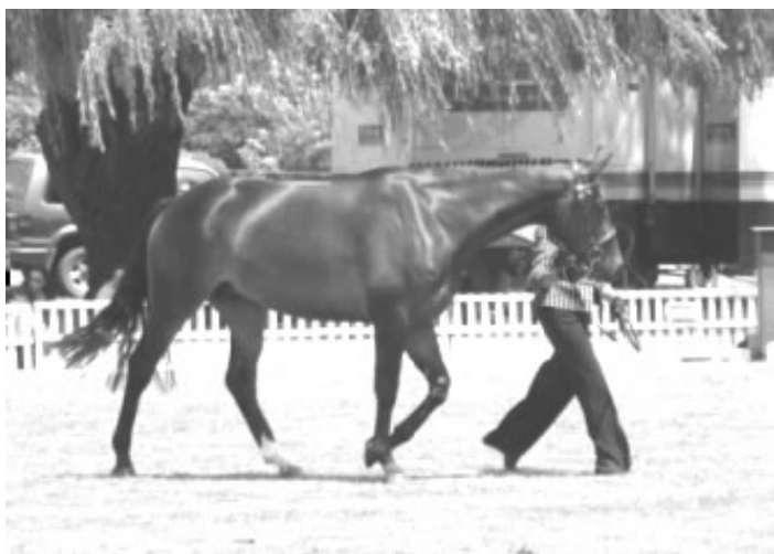
Grand Champion: Eyreleigh Shenanigan