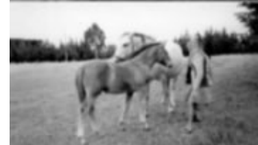
Regaan and Rosy 3 months