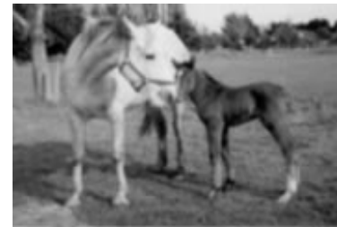
Regaan and Rosey at 3 hours old

Rosy will be backed up in the spring, she is taller in the rear end already at 16 months than the 15.3hh Irish Millenium, see photo. From there she will eventually be shown and then hopefully, I will be able to find a top rider (I think I have one) to show jump her, as well as hunt her myself. Later on Rosey will be bred, but not until she is at least 10 years old. This will depend on soundness and how well she is going. But she will never be for sale, only her progeny. So South Islanders keep a look out for next season in led classes and the Breeders show.