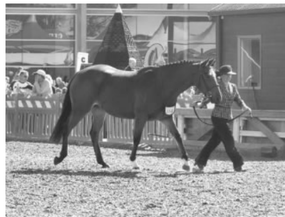
Pictured: "The Last Diamond"

and second in Most Suitable for Showjumping. The first three placegetters in these classes were all Irish. The other two were an imported grey two-year old and a three year old by Mighty Heights.