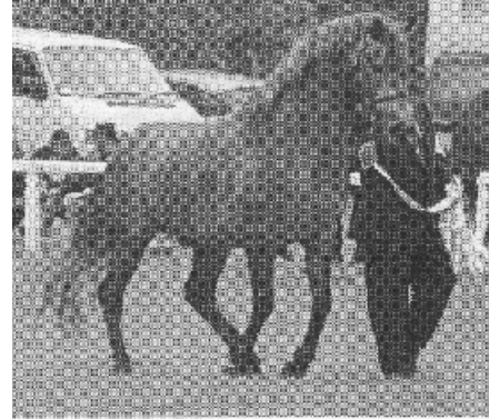
Seageach Reserve Champion Clifden 2002